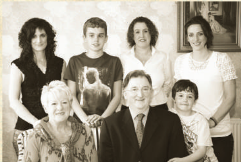
First, second and third family generations