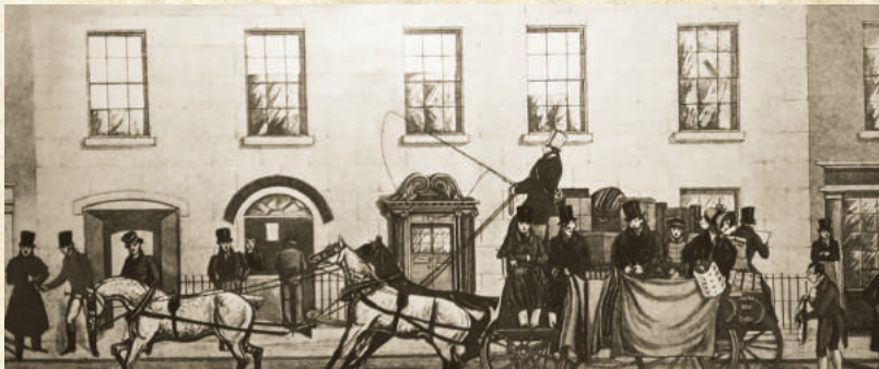
The Car Arrival at Waterford Commin's Hotel - Bianconi's Establishment

Charles Bianconi, known as 'the King of the Irish Roads', purchased the Meagher home and it became known as Commin's Hotel. It was the most important staging post for Bianconi's mail coaches, so much so that it was from the hotel that all milestones and government distances were measured. Bianconi revolutionised public transport and his model was the first example of an integrated transport system in Ireland.