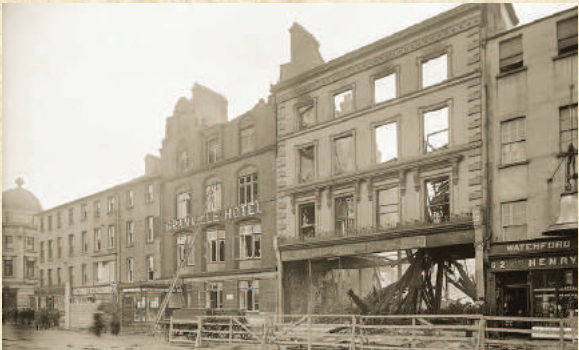
1915 Fire to the Granville Hotel and Hearne & Co. buidlings

The hotel had been purchased by Hearne & Co. Waterford's largest department store. The building suffered extensive fire and water damage and only the outer walls remained. Fortunately, everyone was evacuated due to the rescue efforts of the Fire Brigade and members of the Royal Engineers.