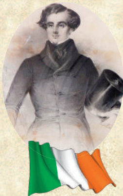
Thomas Francis Meagher