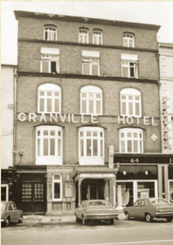
Granville Hotel c1970.